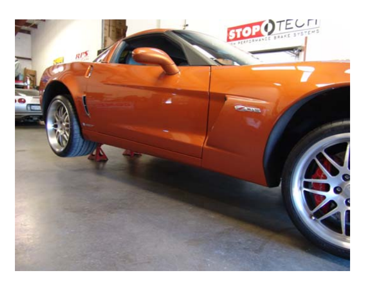
Figure 2: Support and Clean

Start your install by supporting the car with 4 jack stands on a level surface about 12" or more off of the ground. Take some time to wash the area that the rockers are going on, as you do not want to trap any dirt or debris between them and the paint of the car.