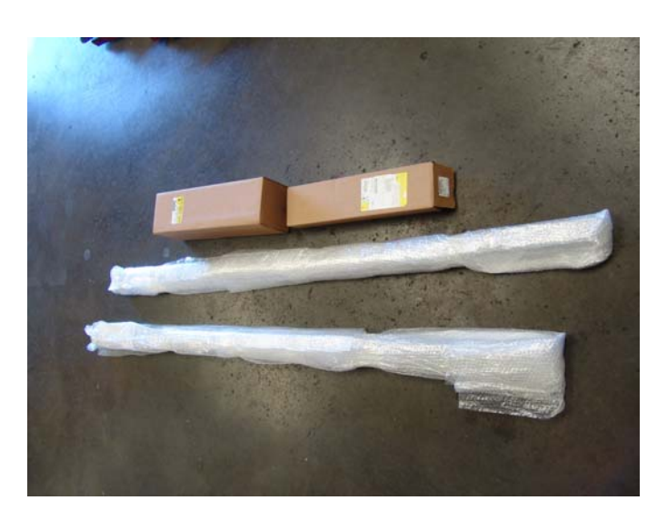
Figure 1: Unpack

Start your install by supporting the car with 4 jack stands on a level surface about 12" or more off of the ground. Take some time to wash the area that the rockers are going on, as you do not want to trap any dirt or debris between them and the paint of the car.