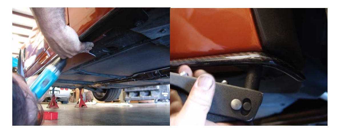
Figure 8: Blow out area being drilled before Rivet install