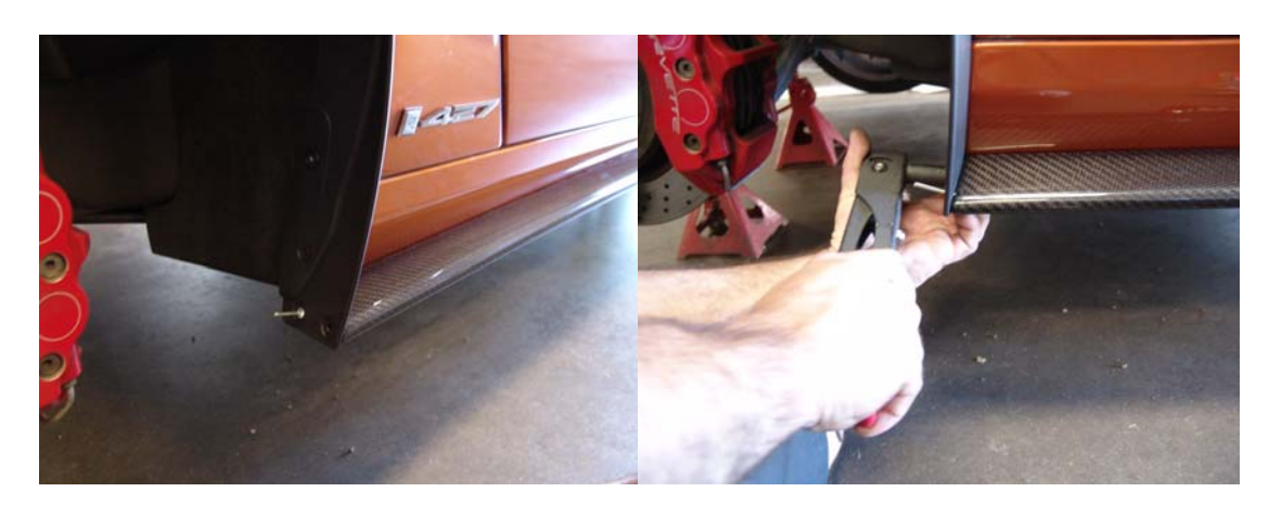
Figure 5: Installing Mud Flap to Rocker Panel

Now that the two pieces are joined you will need to drill the remaining attachment points into the rear fender and lower rocker panel. Use the supplied rivets to attach the mud flap to the car first then work to the rocker panel.