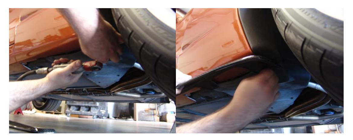
Figure 4: Starting Rocker Install

Now that the mud flap and rocker are loosely lined up on the car you will need to attach the rocker panel to the mud flap at the lower point. You will see two holes in the flap and two holes in the rocker panel already there. Use the two supplied 3/16" rivets with back up washer on the inside rivet. Go ahead and snap the rivets in place at this time with a hand held rivet gun.