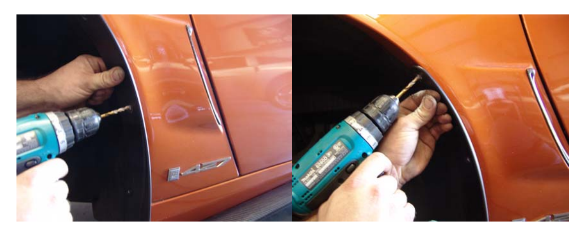
Figure 6: Final install of Mud Flap to car

When drilling and riveting the panel into the rocker on the car it is best to start in the middle and work your way towards either end so you have a flat install against the body of the car. Making sure to blow out the area each time you drill so no debris is between the body and the panel. Once all rivets are in place you can not tighten the front two bolts all the way.