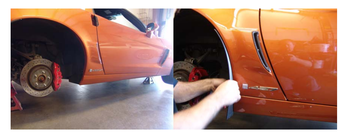
Figure 3: Removal of rear wheel and install of 'mud flap'

Once you have the one bolt in the flap you will now start by mocking up the rocker panel. You will start by removing two screws at the front fender under the car and these will be used to locate the rocker to the car. Lay the rocker panel up against the car and start the two screws at the front. DO NOT TIGHTEN THESE YET!