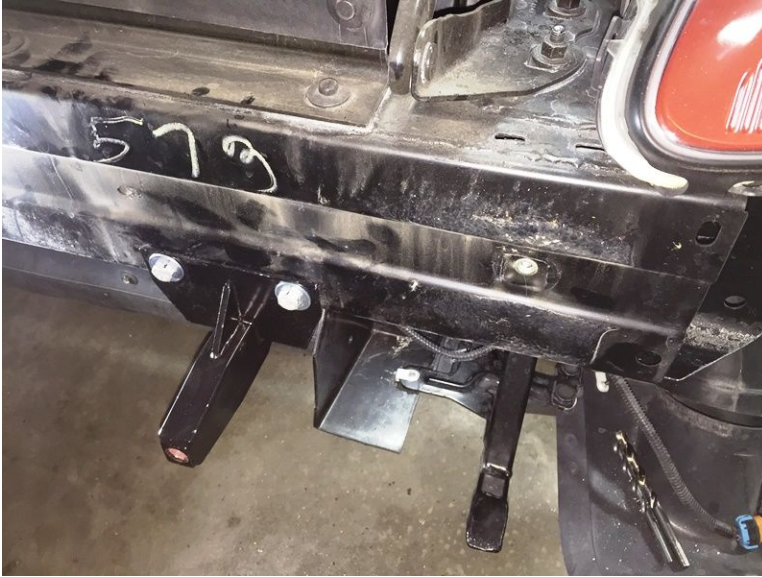
Figure 2: Hook mounted on driver side

Drill this hole open to 3/8". Now use this hole to place the location of the mount to the car, either passenger or driver side. Using one of the bolts, secure the base to the car. Use a magnet or long needle nose pliers to then place the washer and nut onto the bolt from inside the bumper support. Tighten the first bolt down, then you can drill the other remaining three bolt holes into the bumper support.