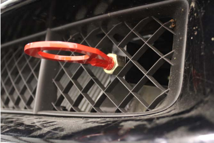
Figure 4: Hook mounted in Z06/GS/ZR1

Once you are finished, the hook should appear like the following: