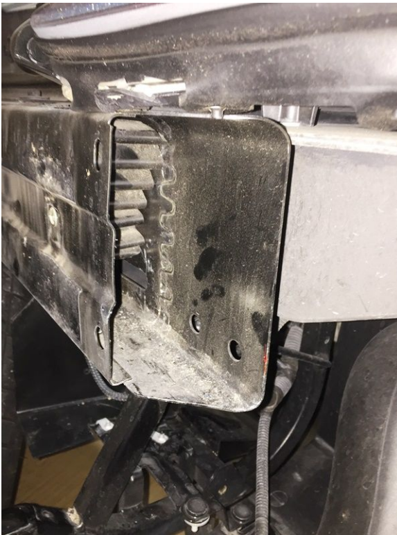
Figure 1: Detail for steel frame cars

*NOTE FOR STEEL FRAME CARS* There is a small piece of steel at the ends of the front bumper support that are spot welded and need to be removed before you are able to install the hook. See figure 1. Once these have been removed you will notice a hole already in the bumper support when looking up from the bottom of the car.