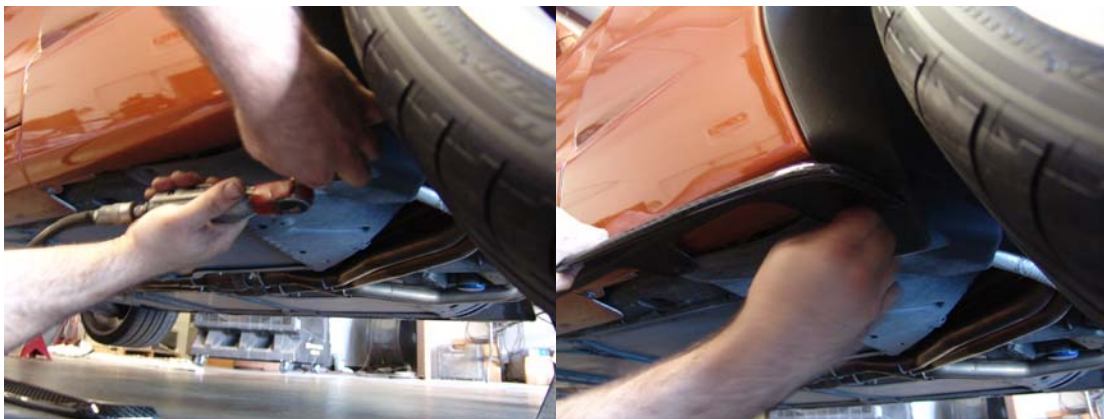
Figure 4: Starting Rocker Install

Now that the mud flap and rocker are loosely lined up on the car you will need to attach the rocker panel to the mud flap at the lower point. You will see two holes in the flap and two holes in the rocker panel already there. Use the two supplied 3/16” rivets with back up washer on the inside rivet. Go ahead and snap the rivets in place at this time with a hand held rivet gun.