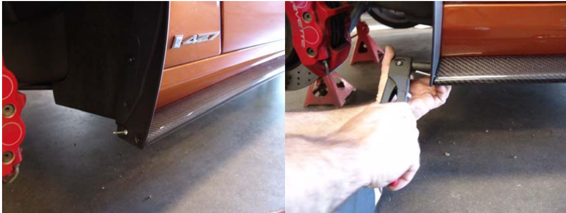
Figure 5: Installing Mud Flap to Rocker Panel

Now that the two pieces are joined you will need to drill the remaining attachment points into the rear fender and lower rocker panel. Use the supplied rivets to attach the mud flap to the car first then work to the rocker panel.