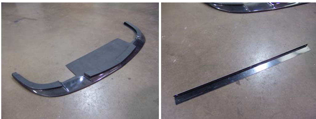
Figure 1: Unpack

Start your install by supporting the car with 4 jack stands on a level surface about 12” or more off of the ground. Take some time to wash the area that the splitter is going on, as you do not want to trap any dirt or debris between it and the paint of the car.