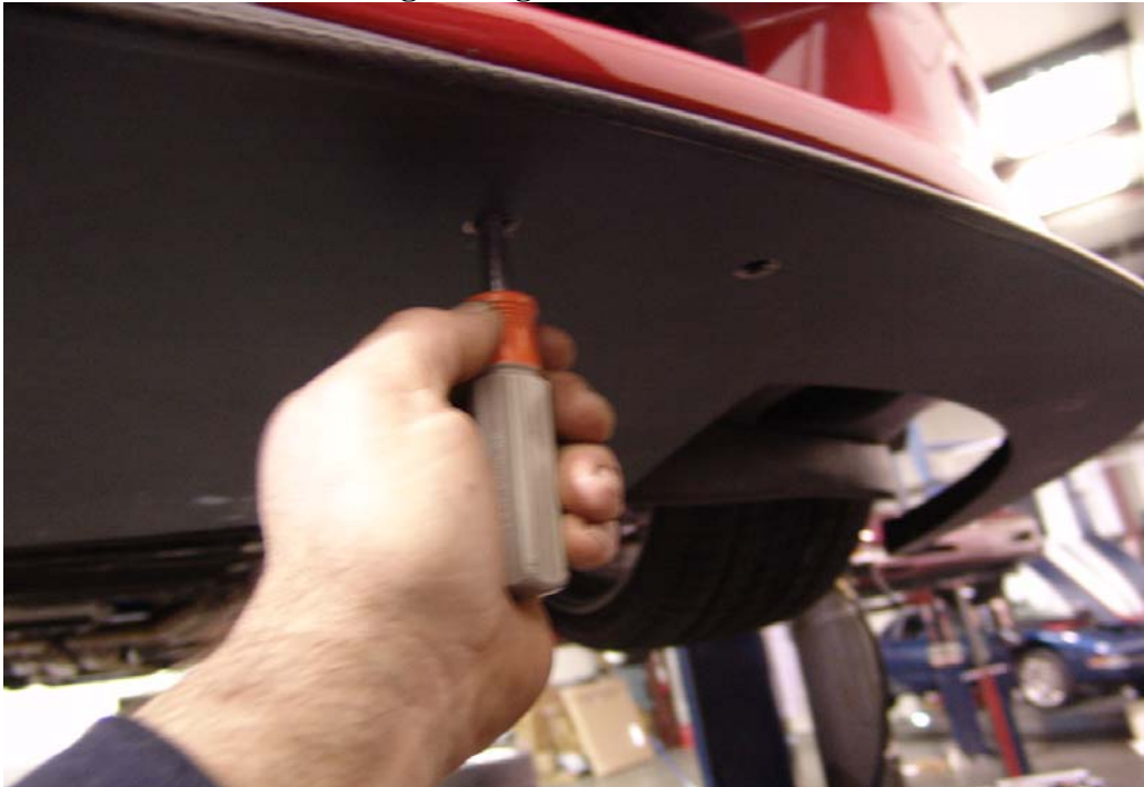
Figure 5: Install of bolts and tightening

Once these first three bolts in the middle have been started, you can now reach from the back side of the splitter, insert the other bolts and tightening them into place. Start all bolts first, and work your way from the center around the nose going side to side to bolt it up evenly as you go.