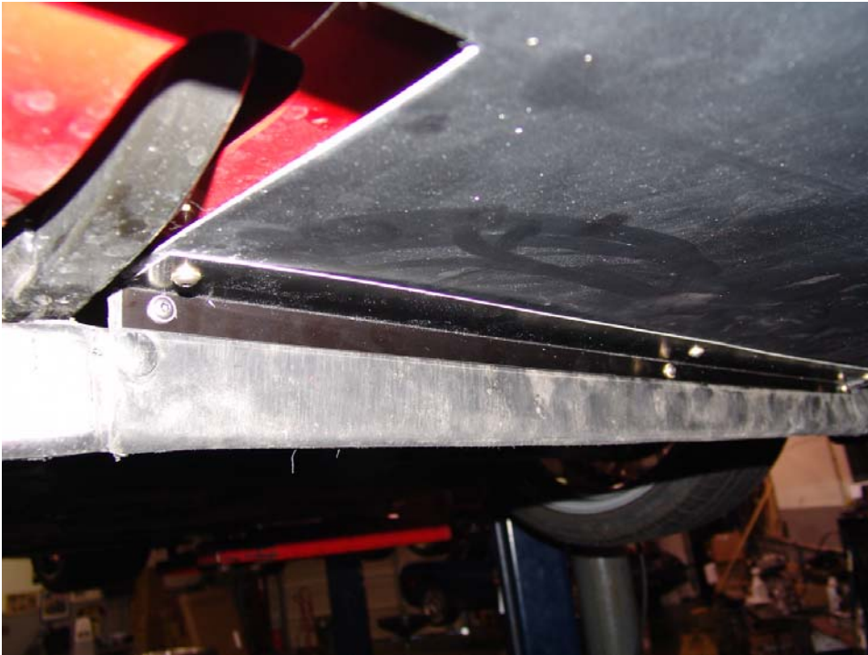
Figure 12: Finished!