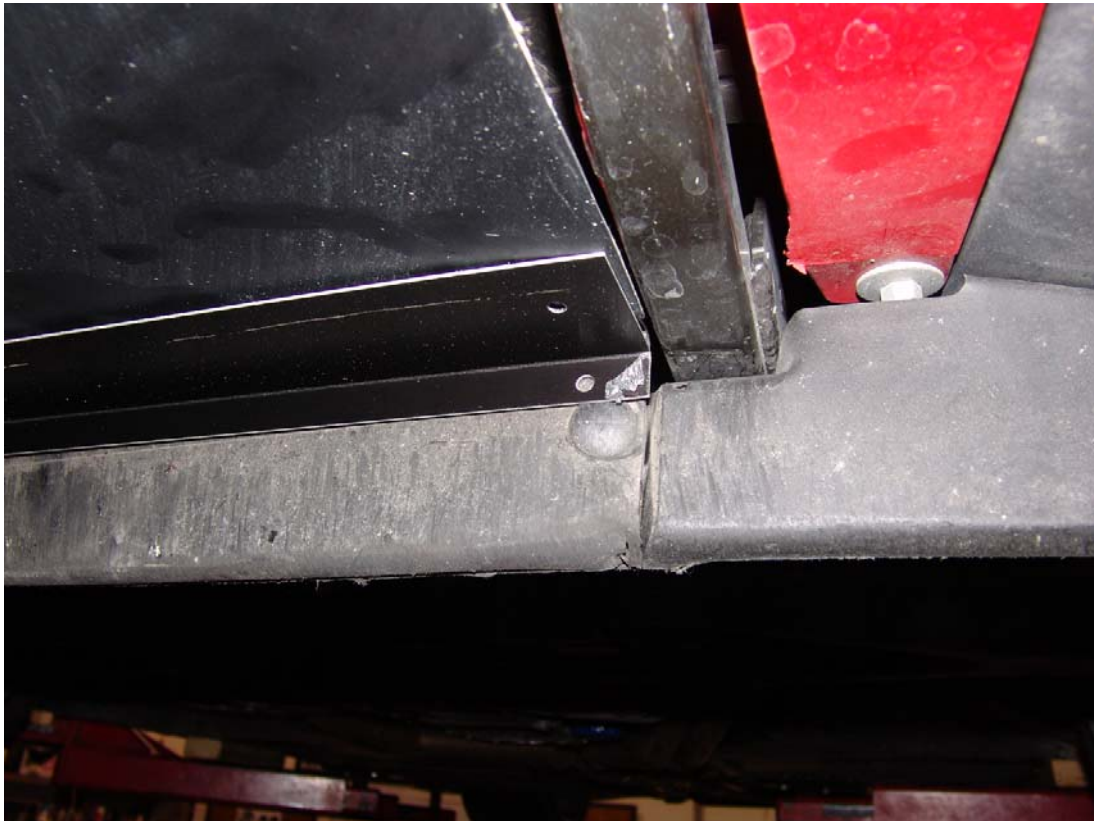
Figure 6: Mock up for install of brace:

Once you mock up your brace, mark the holes in the splitter first and drill these. You will now bolt the support to the splitter once these three holes are drilled, using the supplied hardware. There are already three holes in the aluminum support, use these as a template to mark the holes for the splitter piece. When installing the bolts, place the small washer between the bolt head and the aluminum and the large washer on the back side between the splitter and the nut.