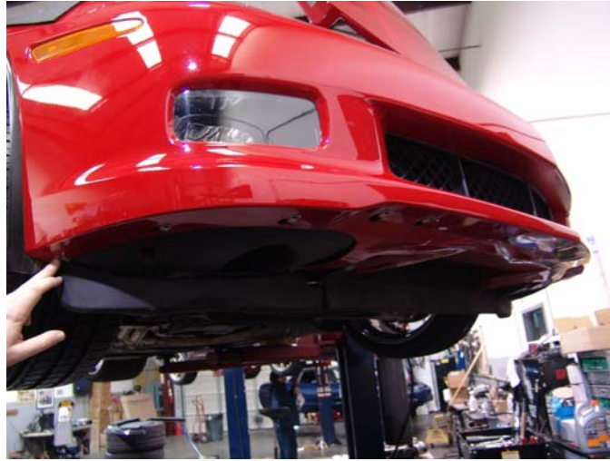
Figure 3: Removal of factory splitter

Now that the factory unit is off, look at your splitter. You will notice that the holes on it line up with most of the holes already on the nose of your car. Four of these will not be used, these are right above the cut outs for the brake ducts on the splitter. For those of you not using the GM support piece please start below, those of you that will be doing this you will need to remove the nose to install this piece. LG's carbon splitter DOES NOT REQUIRE the use of this piece.