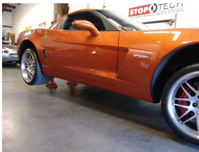
Figure 2: Support and Clean

Once the car is supported and you have washed the area clean you will need to remove the factory front splitter piece by using a 7mm nut driver. Be sure to save these as you will need to use them to start the install of the new carbon piece.