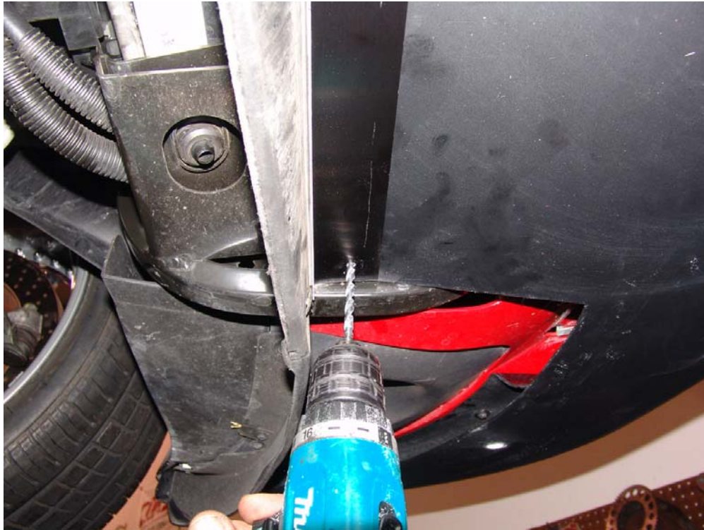
Figure 8: installing hardware on top side.