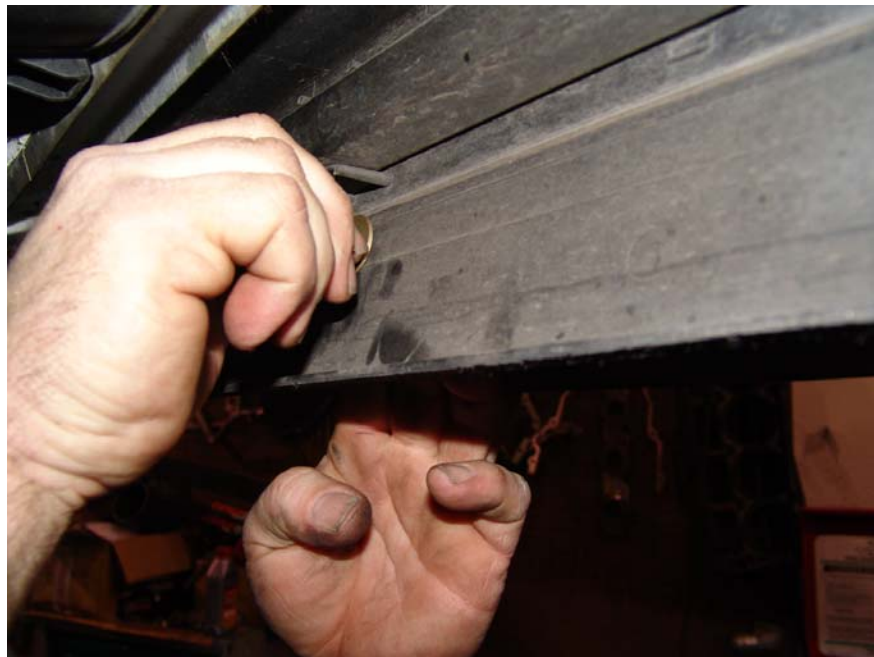
Figure 10: Installing hardware.

Again, bolt these just like you did on the top side, with the small washer between the bolt and the metal, and the large washer on the back side between the rubber and nut.