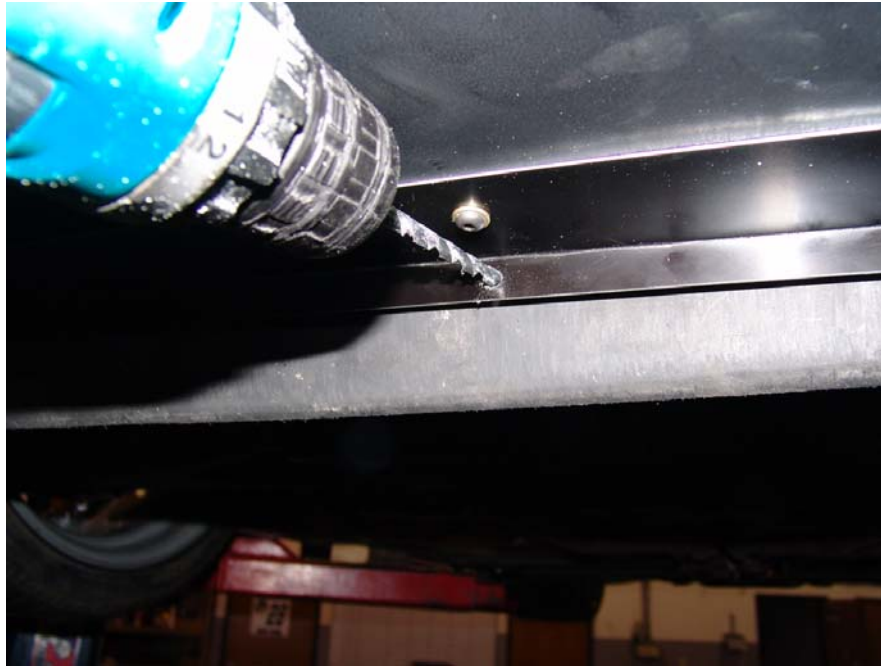
Figure 9: Drilling holes into vertical support

Again, bolt these just like you did on the top side, with the small washer between the bolt and the metal, and the large washer on the back side between the rubber and nut.