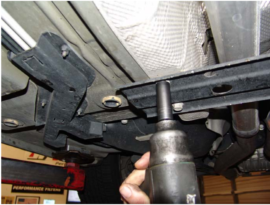
Figure 2: Center tunnel brace removal.

Now move to the front of the car and un-bolt the clamps at the cats at the front of the car and remove the mufflers from the hangers and the mid pipe hangers under the diff. You may need to have a friend help you as the mid-section and mufflers is welded together and removes as one piece. This is heavy so have help.