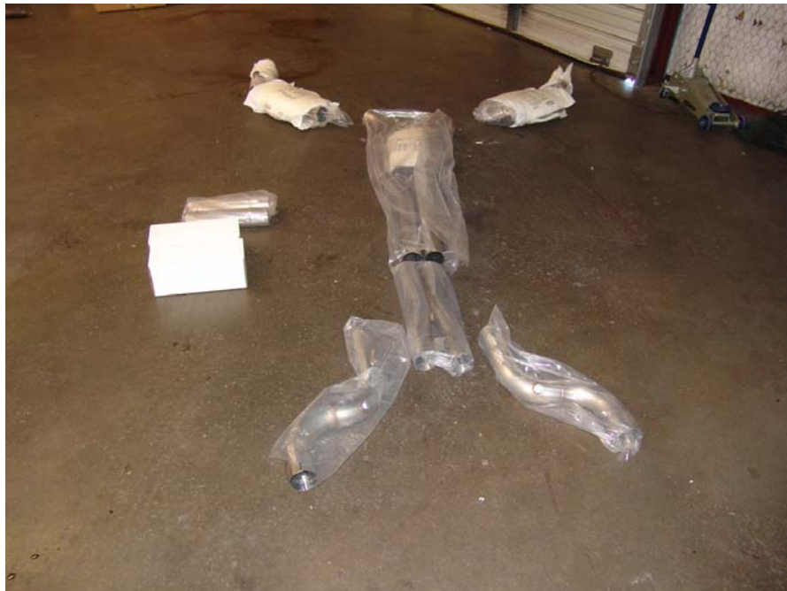
Figure 12: Rear S pipes, X pipe, mid section and optional mufflers

Now that the headers have been installed, slide one 3" clamp over each collector and install your high flow cats or your off-road pipes. Once these are on, slide over one more 3" clamp on each of these pieces. You can loosely tighten the clamps down, but do not tighten all the way until the entire system has been hung in place and adjusted. The remainder of the exhaust will look like the layout shown in figure 12.