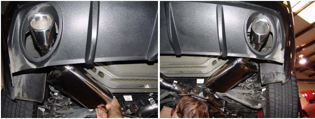
Figure 18: Install of Mufflers

Once installed, make sure all clamps are tight and wires plugged in. We suggest checking header bolts after the first heat cycle. Now you are ready for the tune and first drive!