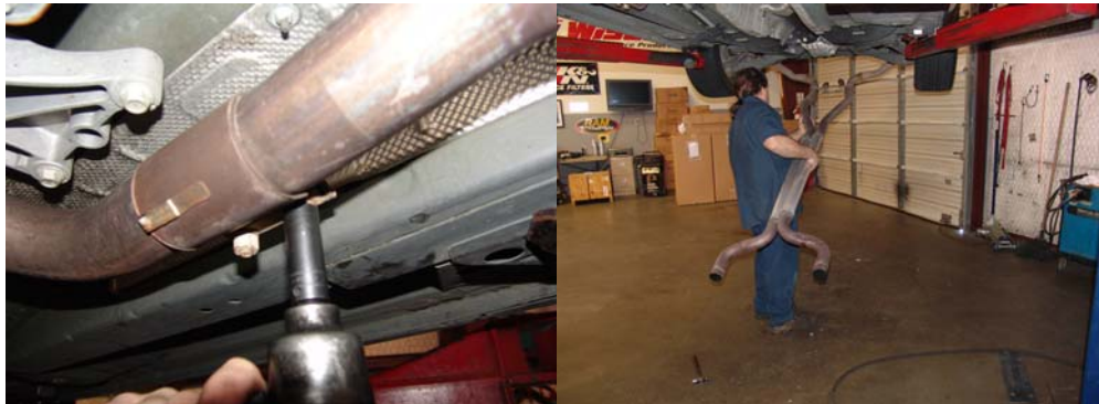
Figure 3a, 3b: Removal of stock mid section and mufflers

Now move to the front of the car and un-bolt the clamps at the cats at the front of the car and remove the mufflers from the hangers and the mid pipe hangers under the diff. You may need to have a friend help you as the mid-section and mufflers is welded together and removes as one piece. This is heavy so have help.