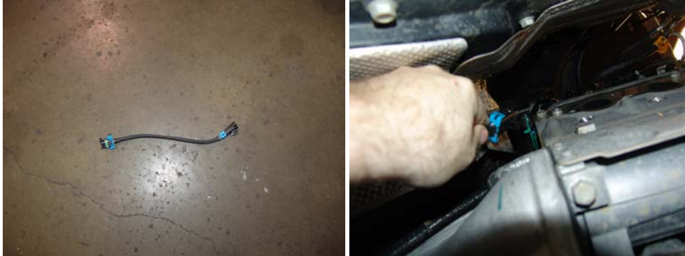
Figure 8: Front O2 sensor extension

Before install, take this time to install your front O2 sensor extensions onto the car harness where you unplugged the factory sensors. Now you can start by installing the driver side header from the bottom side of the car. The headers should slide into the engine compartment by pointing the collector towards the inside of the car and down, and rotate into place. You can 'hang' them from the head bolts until you can go back on the top side. I suggest installing only a front and rear bolt with the gasket first then only starting the rest of the bolts before installing the rest of the system. Once the headers are there you can install the sensors and plug into the extensions.