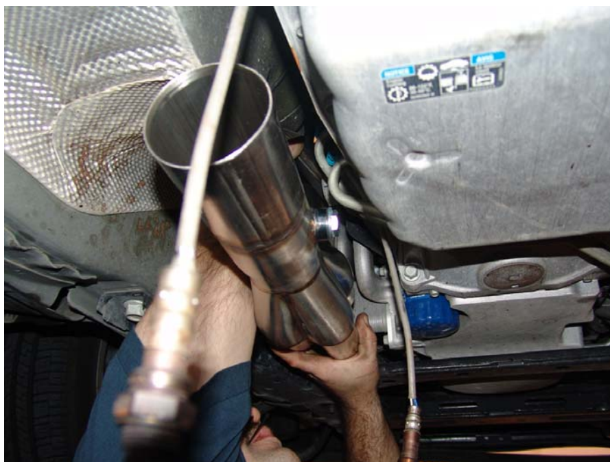
Figure 9: Install of Driver side header

Now install the header on the passenger side to start the rest of the install. The header should install from the bottom up. We also only recommend using GM header gaskets for the 2000 LS1 Camaro/Corvette as these use the same port design as the headers and have proven the best seal.