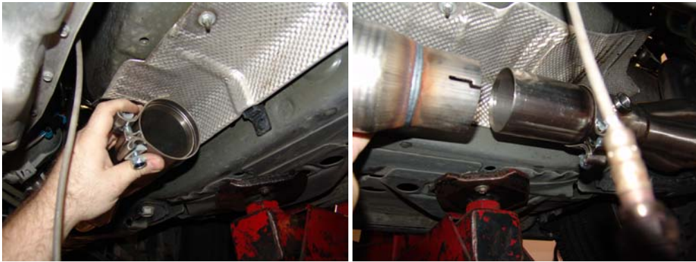
Figure 13a and 13b: 3" clamp over collector and high flow cat onto collector