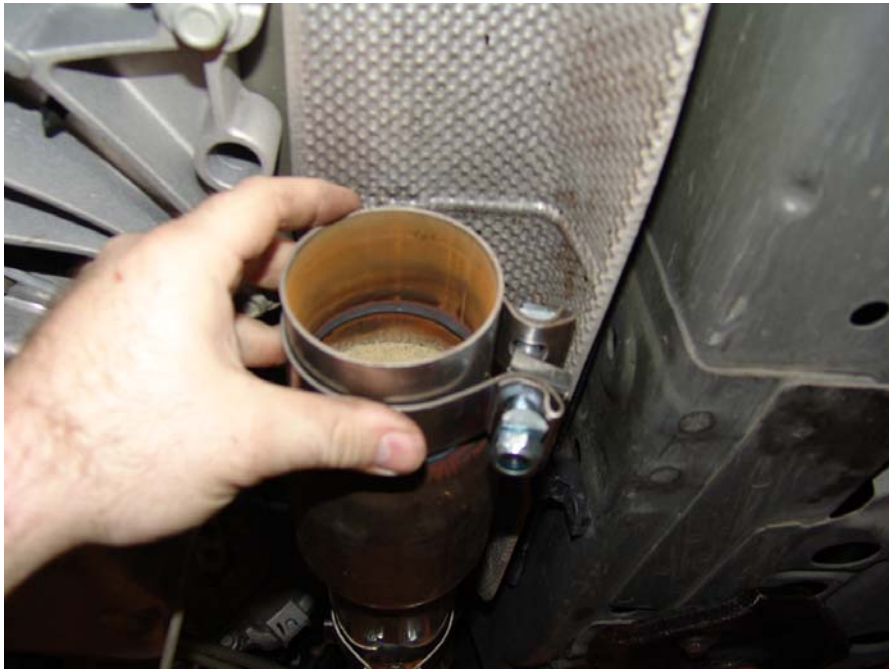
Figure 14: High flow cat installed with 3" clamp