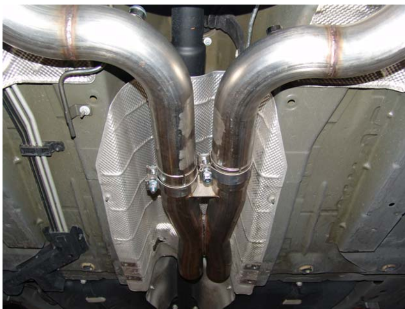
Figure 16: install of X pipe onto S pipes.