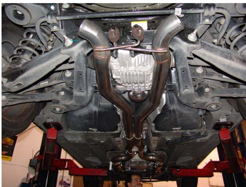
Figure 17: Rear mid section installed into rear hangers.

Once you have the entire mid section installed and loosely tightened into place it is now time for a decision. If you have the LG high flow 3" mufflers then you can simply slide over your next pair of 3" clamps, install the mufflers, align and tighten all of your clamps working your way rear to front. If you want to re-use your stock mufflers you need to measure and cut the factory mufflers from your stock system and use the supplied adapters to install. If you have an aftermarket system that is 2.5" then use the adapters, and install just like you did on your stock system. Align your mufflers first and work your way forward on tightening the clamps.