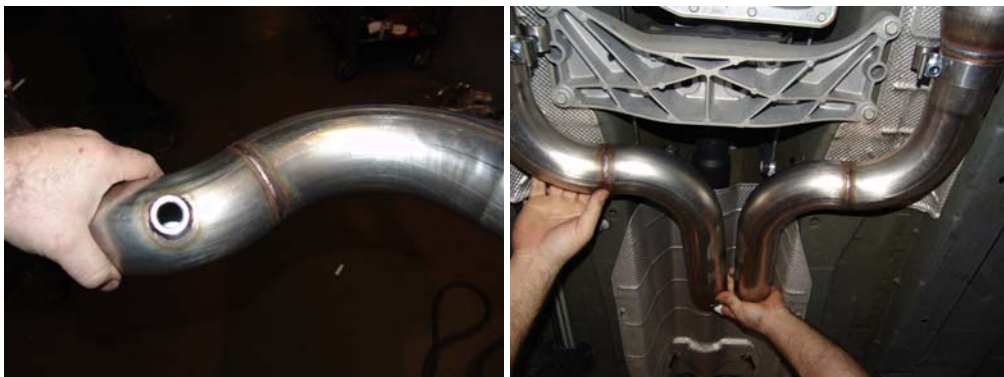
Figure 15: S pipe being installed with rear O2 sensors.