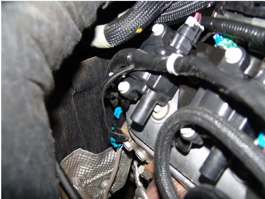
Figure 6: Passenger side front O2 sensor location

Once the rear O2 sensors have been removed, the front O2 sensors have been unplugged and the spark plug wires and plugs removed you can now start to un-bolt and remove the exhaust manifolds. These will hang in place until you can pull them out. These will come out from the bottom of the car with the cats. Once they have been removed you will need to remove and save the front O2 sensors for install into the headers.