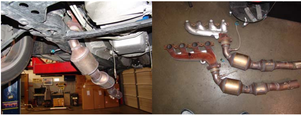
Figure 7: Removing manifolds and cats.

Before install, take this time to install your front O2 sensor extensions onto the car harness where you unplugged the factory sensors. Now you can start by installing the driver side header from the bottom side of the car. The headers should slide into the engine compartment by pointing the collector towards the inside of the car and down, and rotate into place. You can 'hang' them from the head bolts until you can go back on the top side. I suggest installing only a front and rear bolt with the gasket first then only starting the rest of the bolts before installing the rest of the system. Once the headers are there you can install the sensors and plug into the extensions.