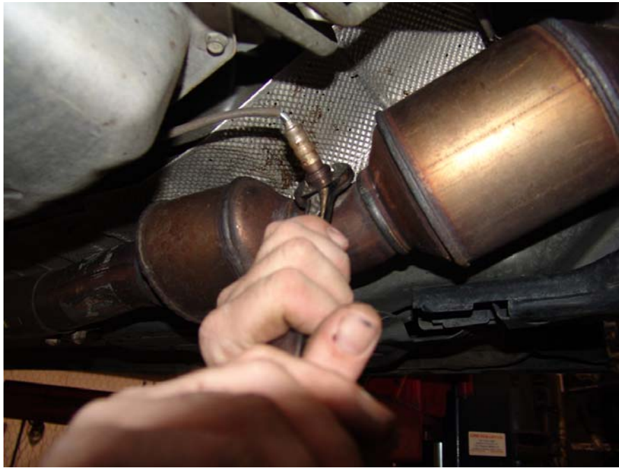
Figure 4: Removing rear O2 sensor.